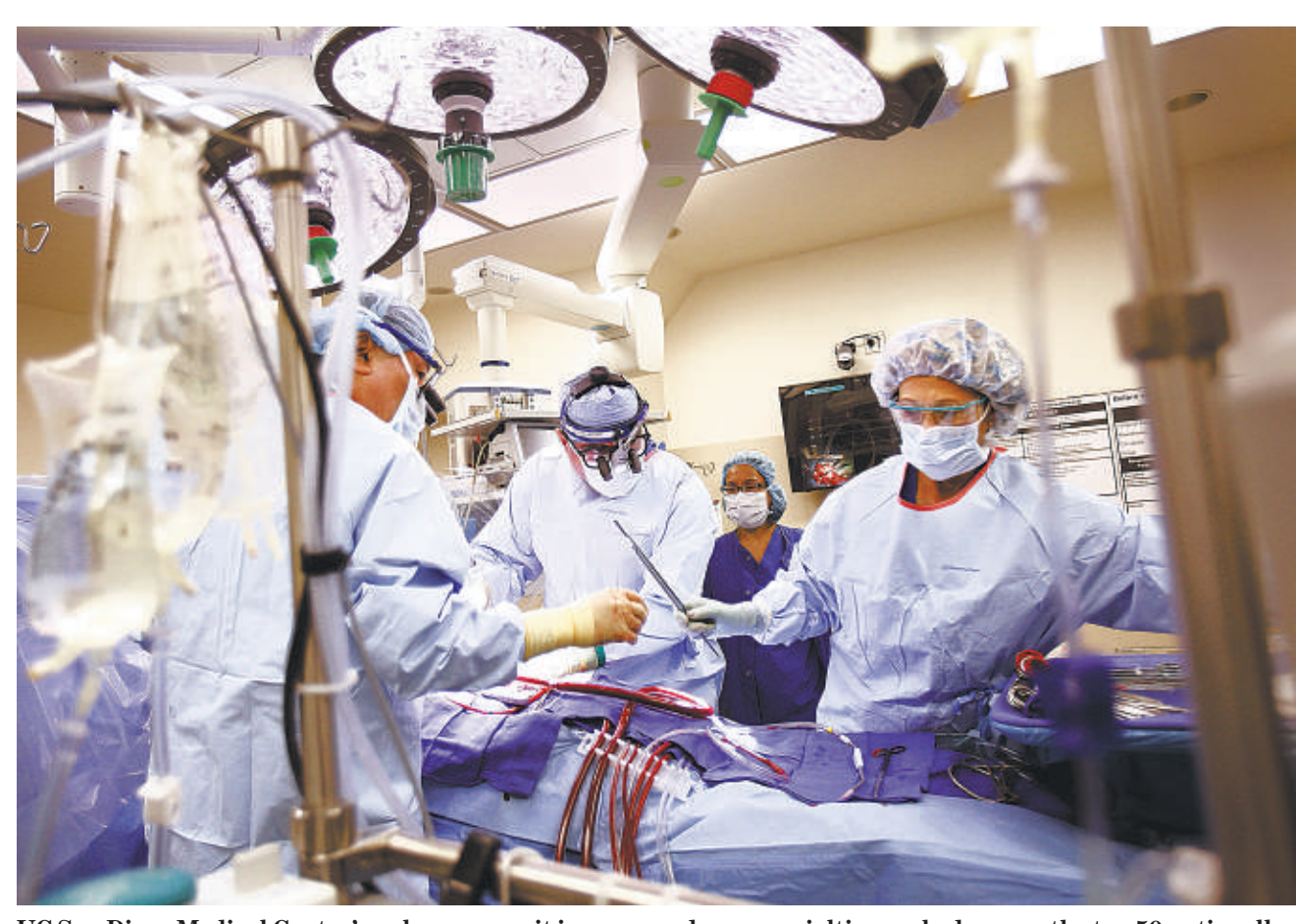
UC San Diego Medical Center's pulmonary unit is among a dozen specialties ranked among the top 50 nationally, according to U.S. News & World Report. Last year, UC San Diego earned 11 rankings.

In the face of the severe drought SEE WATER • A7