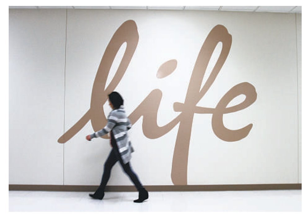
Biotech company Thermo Fisher bought Carlsbad-based Life Technologies last year for $13.6 billion, acquiring its genomic expertise.

Newer local companies such as Human Longevity of